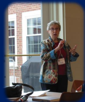
Beverly Minor Churches in Duluth