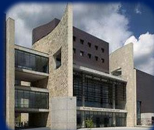
National Underground Railroad Freedom Center Museum